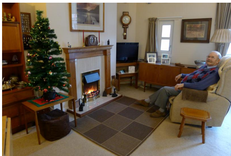
The completed project – and looking swell