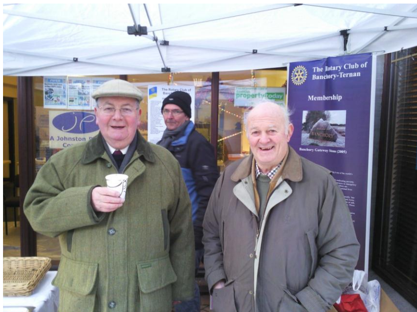
Fermers at the Fermers' Merkit (+ the 'gype' fae Gight)

The Mulled Wine and Mincemeat Pies stall run by Rotary annually at the Christmas "Farmers' Merkit" was well supported by members on 17 th December.