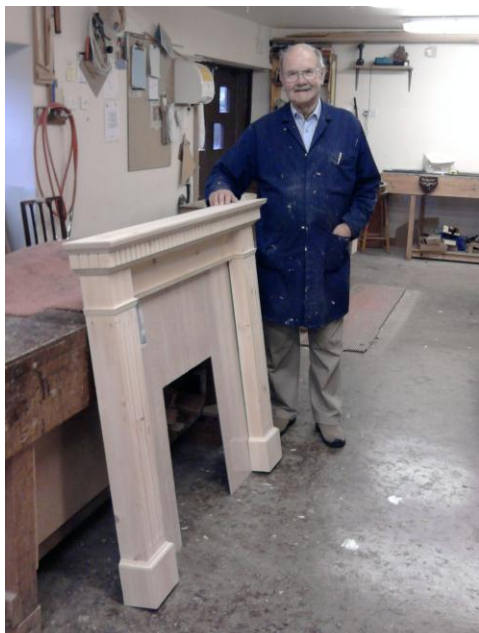
The fireplace built & ready to be stained