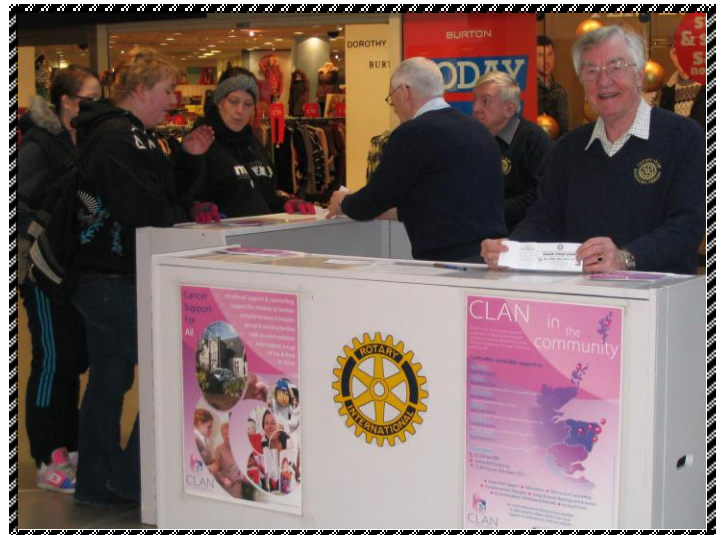
As the morning wore on the sellers were kept busy

Helping to sell Raffle tickets for the Mini One kept Rotarians from the clubs involved very busy for a large part of 2011. But the striking features of the car made it an easy job and there were always plenty of willing buyers to try their luck, whilst supporting CLAN at the same time.